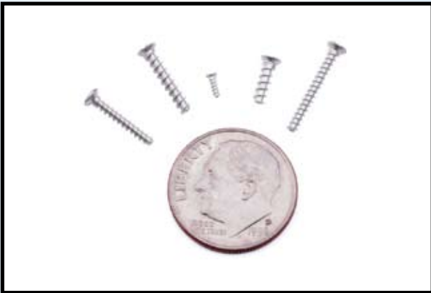
Titanium bone screws