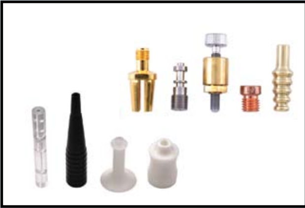
A variety of materials including: ABS, BeCu, Brass, Copper, Delrin, Nylon, Polycarb & SST