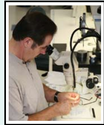
FDA Registered; GMP Compliant