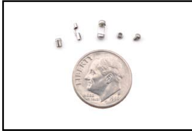
Complex milling on microcomponents