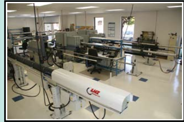
Automated material loading