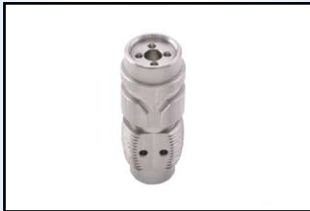
C-Axis machining and circular threading