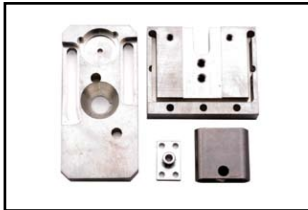
CNC milling, large and small components