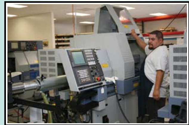
Latest technology equipment